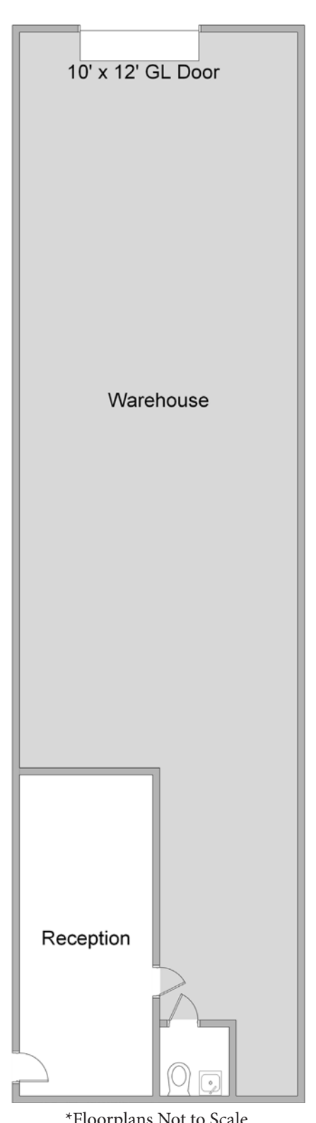
*Floorplans Not to Scale