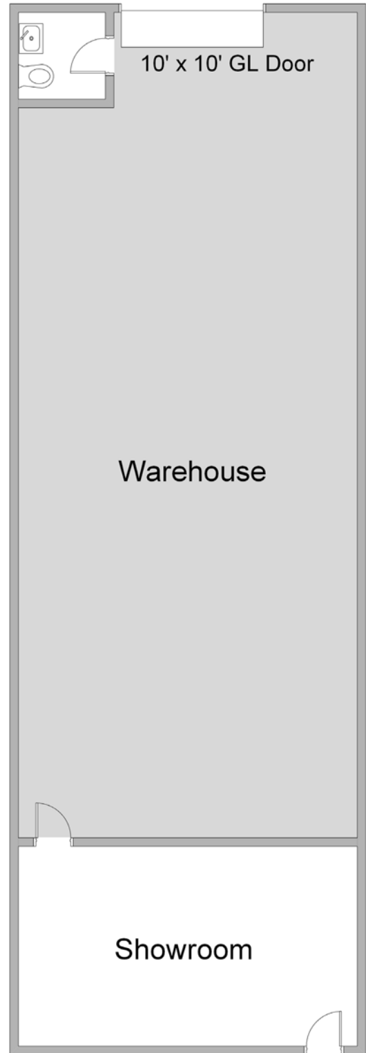
*Floorplans Not to Scale