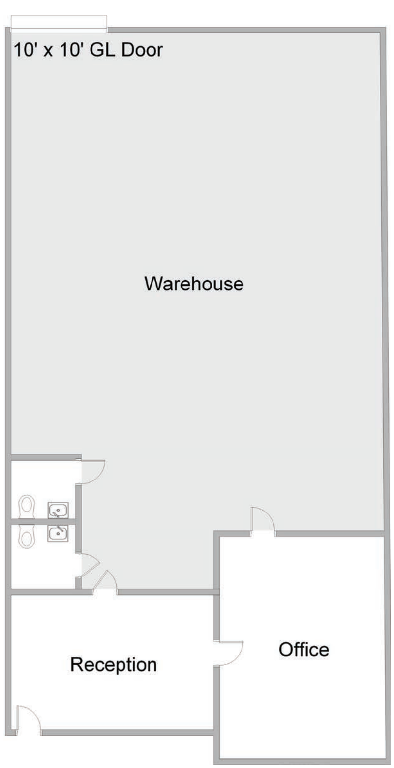
*Floorplans Not to Scale